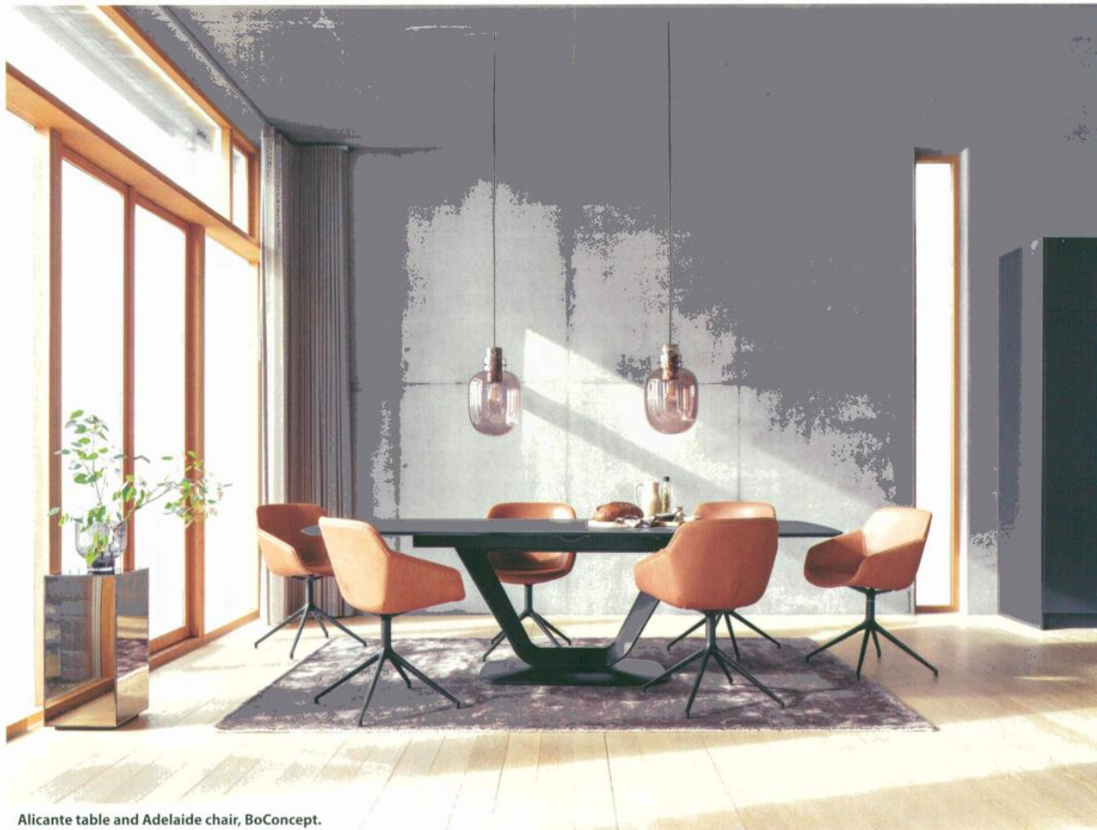
Alicante table and Adelaide chair, BoConcept.

D ining rooms have become so much more than just a place where you gather to eat one meal a day. Finally, we are able to gather again as friends and family to enjoy a long afternoon of sharing food, stories and laughter. And what better place to do this than at the dining room table?