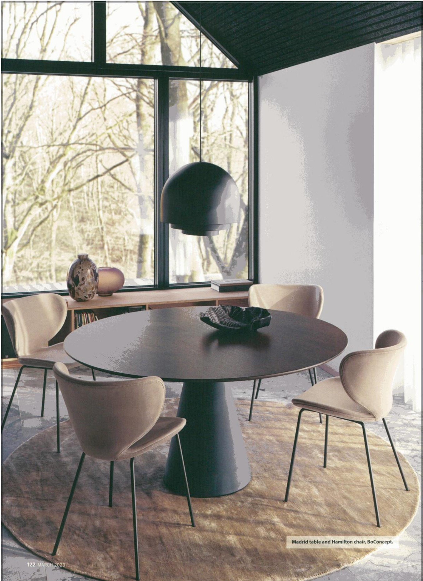
Madrid table and Hamilton chair, BoConcept.