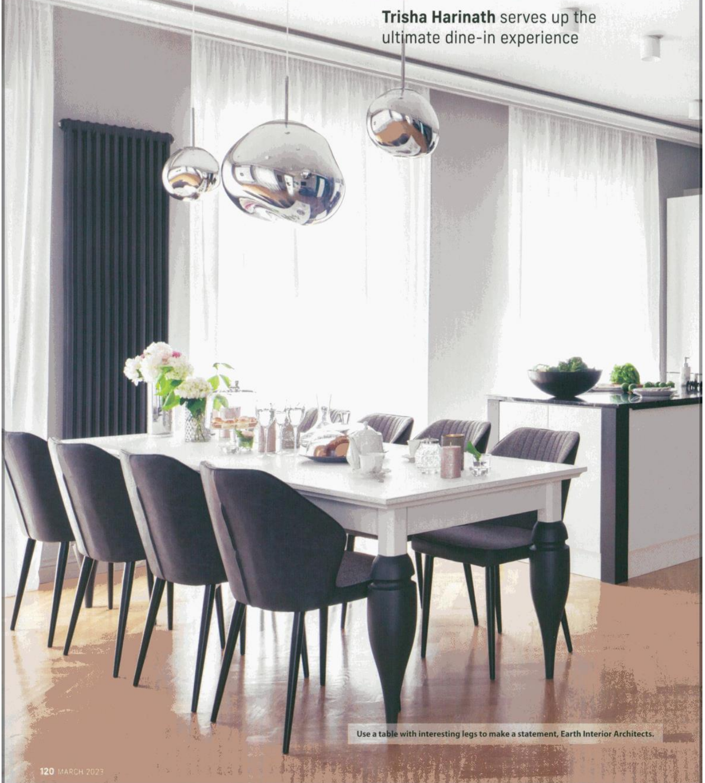
Use a table with interesting legs to make a statement, Earth Interior Architects.

Trisha Harinath serves up the ultimate dine-in experience