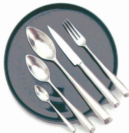
Ann Demeulemeester silver-plated set, Babylonstoren.