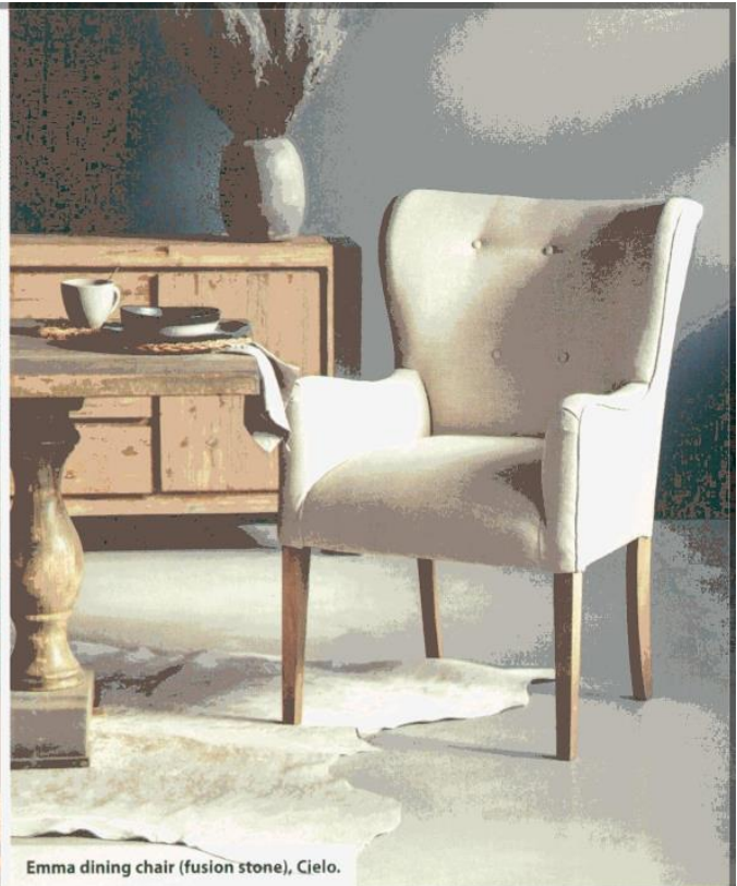
Emma dining chair (fusion stone), Cielo.