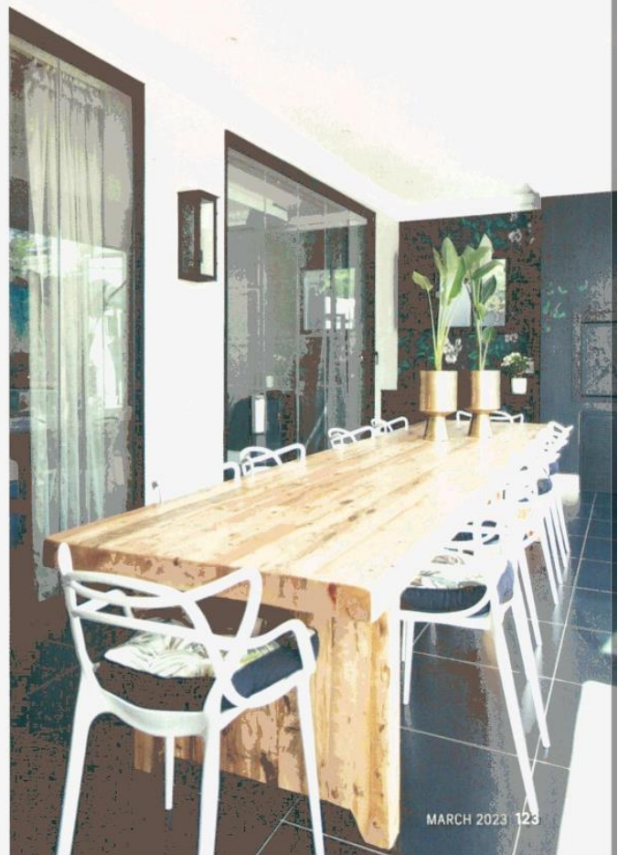
MARCH 2023 123

Choose the appropriate materials for your outdoor set, Kim Williams Design.