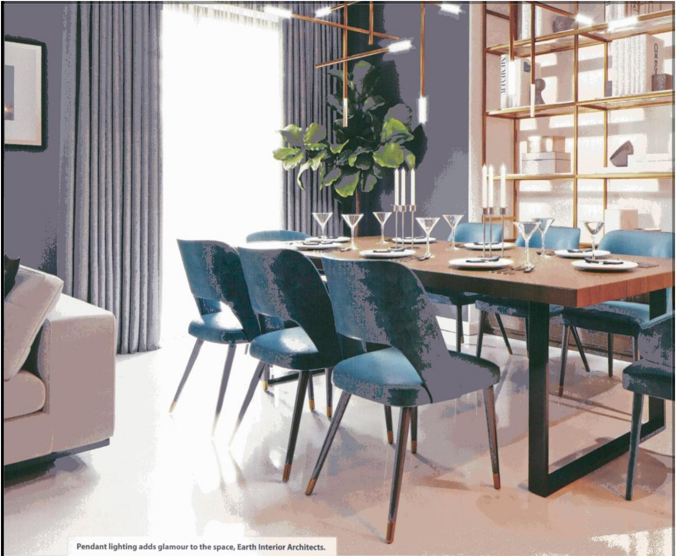
Pendant lighting adds glamour to the space, Earth Interior Architects.