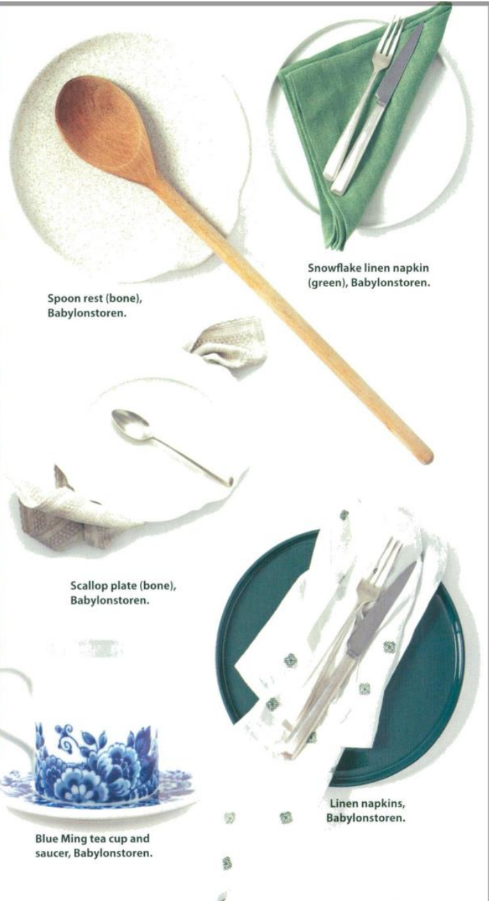
Spoon rest (bone), Babylonstoren.